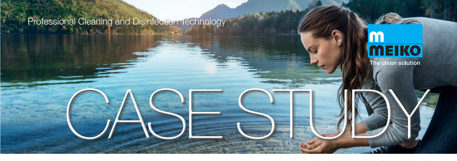
WHY CLIENTS CHOOSE MEIKO